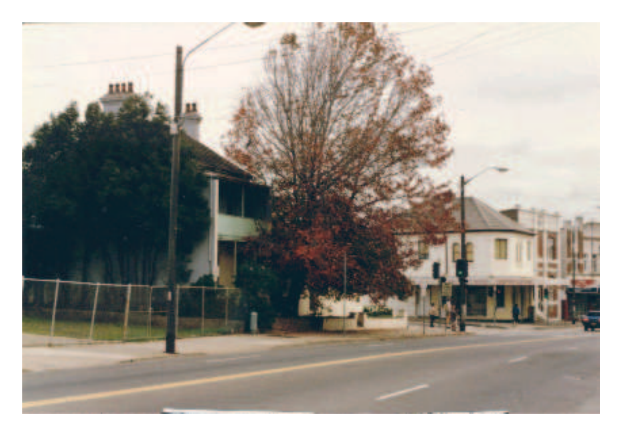
Two contrasting historic views of 160 Liverpool Road and its context. Above , a photograph taken in the 1980s. The house on the left, now demolished, is 'Mittagong Villa'. No 160 is on the far corner of Holden Street. Below , an engraving from the Town & Country Journal, showing No 160 on the far left, as it was in 1884